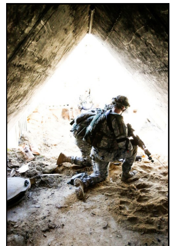
Twelve 1/503d Troopers attended the Italian 6th Army Military Mountaineering and Ski Warfare School from 23-26 Feb 15.